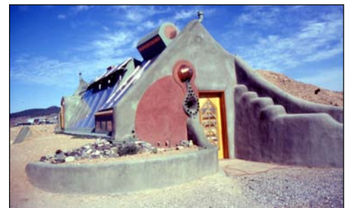
Exterior of Hut House, Taos, New Mexico.